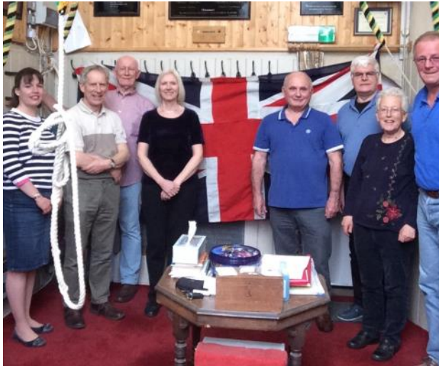
April Day Triples at Hungerford