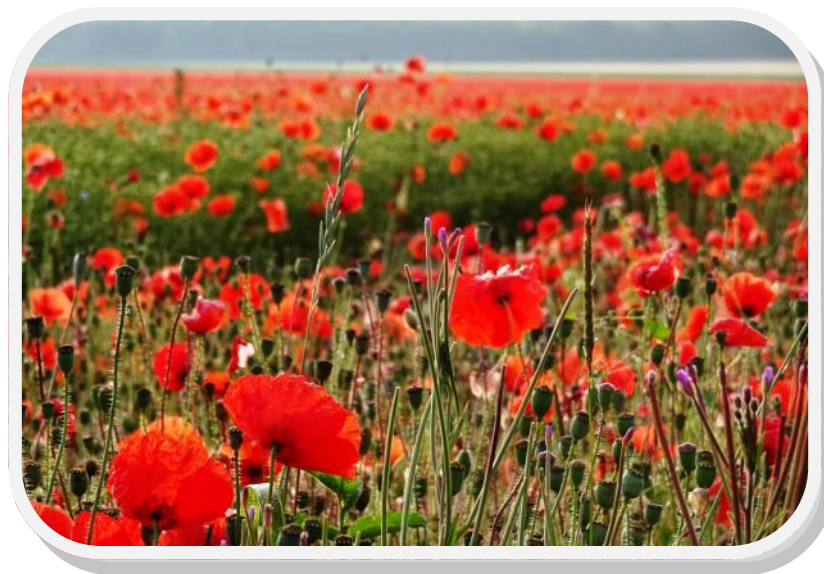
A field of poppies near Stonehenge